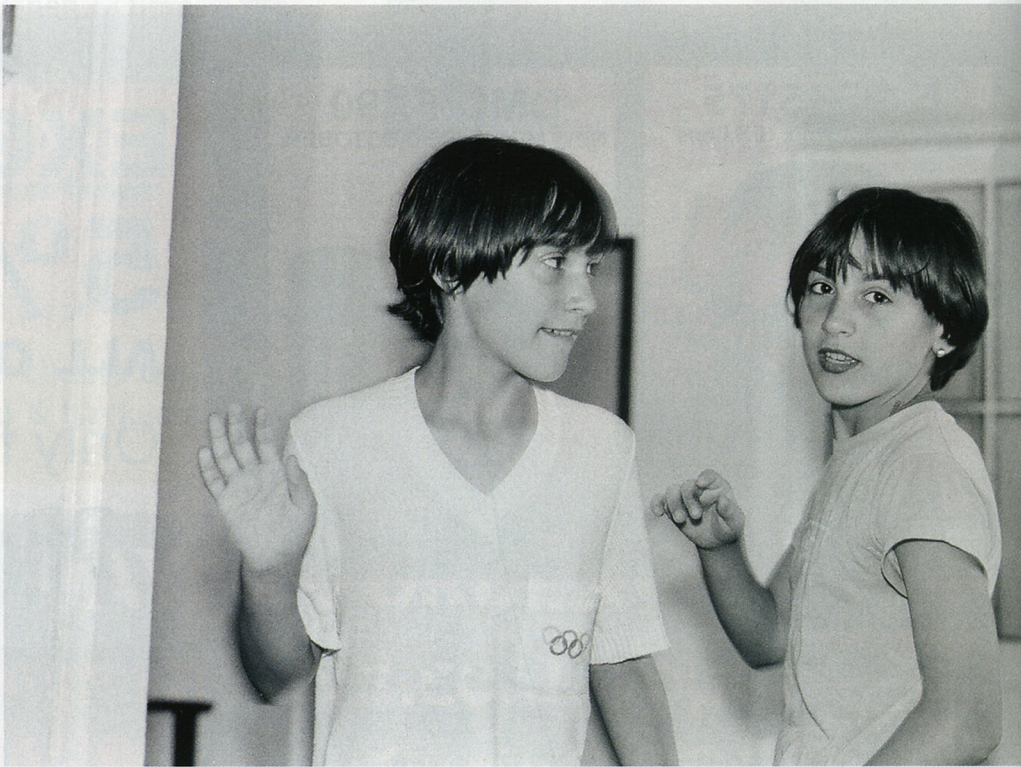
Above: 'B' and 'A' in 1997 when they were 12. Opposite page: 'B' in April 2010 in Switzerland, where she works as a nanny. 'B' wants to remain anonymous because she is an illegal immigrant and has had a traumatic life. She was sold by her own brother and sexually trafficked to Italy, where she worked in an illegal brothel. She was rescued in a police raid and sent back to Romania, after which she decided to take a chance in Switzerland.